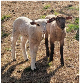
Fawn and Tawny