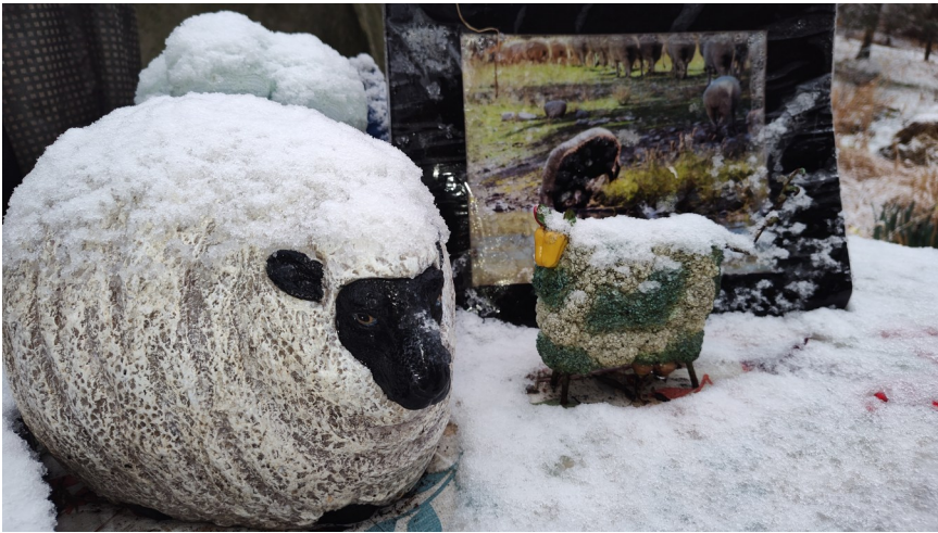
A snow scene right outside the shepherd's kitchen door! This snow-covered "ewe" is the best Shepherd Eddie can do, these days!