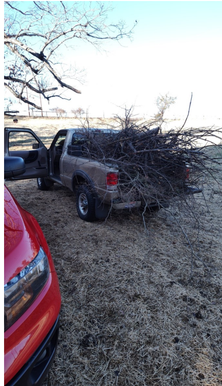
Cleaning up the fallen brush, found in and around the meadow, was a priority ~ a necessary chore to do ~ shortly after the expectant ewes left the meadow, that sad, sad winter day! Looks like a pickup truck load, for sure!